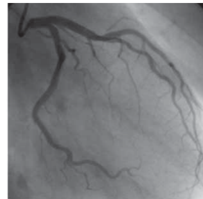
Normal coronary arteries on the left side of the heart.

The Heart Foundation provides additional resources on: