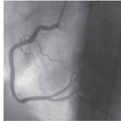
Normal coronary arteries on the right side of the heart.

Your doctor may use the diagrams below showing the coronary arteries to explain his/her findings.